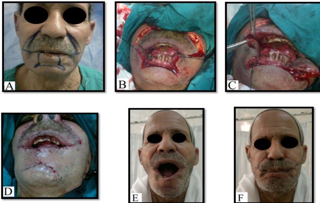
Figure 1. A 69-year old male with SCC affecting about 2/3 of the lower lip underwent bilateral Webster flaps. (A). Pre-operative flap design. (B). Intra-operative view shows full layer excision of the tumor with 1cm safety margins and excision of the two Burrow's triangles of skin and subcutaneous tissue. (C). Intra-operative view shows mucosal flaps that used for reconstruction of the vermilion. (D). Intra-operative view after the two flaps were advanced medially. (E). (F). Four months post-operative view shows good functional and esthetic outcomes.

aim to maintain the sphincter function, preserve adequate mouth opening and achieve an esthetically pleasing skin coverage (Memon et al., 2008). There are several reconstructive techniques to be selected from, according to location and size of the defect and availability of adjacent tissues (Ebrahimi et al., 2011). Although, most Plastic Surgeons choose tissues for lip reconstruction from the remaining lip tissues followed by the opposite lip then the adjacent cheek and finally distant tissues, it is difficult for them to select the ideal reconstructive method (Rifaat, 2006).