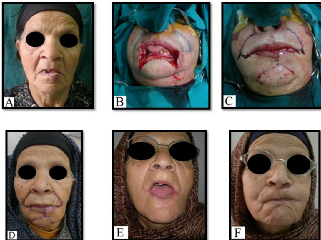
Figure 2. A 68-year old female with SCC affecting about 2/3 of the lower lip underwent bilateral Webster flaps. (A). Pre-operative picture. (B). Intra-operative view shows full layer excision of the tumor with 1cm safety margins. (C). Intra-operative view after the two flaps were advanced medially (D). Early post-operative picture. (E). (F). Five months postoperative view shows good functional and esthetic outcomes.

slightly superiorly from the labial commissure and should be from one half to one third of the transverse diameter of the lip defect. The apices and the medial sides of the Burrow's triangles on the melolabial sulcus, while their lateral sides connecting the apices to the horizontal line of the commissure. All operative procedures were done under general anesthesia with nasotracheal intubation. We performed full layer excision of the tumor with 1cm safety margins in a quadrilateral shape with its lower border in the labiomental groove. Thereafter, we made incisions in the marked area to excise the two Burrow's triangles of skin and subcutaneous tissue down to the muscle layer. (Figure 1b) The lower mucous membrane incisions were situated 0.5 cm above the alveolo-buccal groove, while the upper mucous membrane incisions were made about 1cm above the labial commissure and below the orifices of Stensen's ducts to create flaps from oral mucosa that used for reconstruction of the vermilion. (Figure 1c)